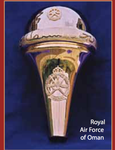
Royal Air Force of Oman

The Drum Majors' Staff was introduced into the British Army in the 18th century. The staff is not simply a designation of authority but is used by defined drill movements to signal commands to the Band. Drum Majors' Staffs are made to order. It is customary for the regimental Staff to carry the Regimental or Unit title, Badge, Devices and on occasions Battle Honours, inscribed around the head. The Staff is fashioned from base metal or Sterling Silver, finished in silver plate or gold gilt. Best quality real Malacca canes are fitted. The average length overall of a Staff is 58 inches.